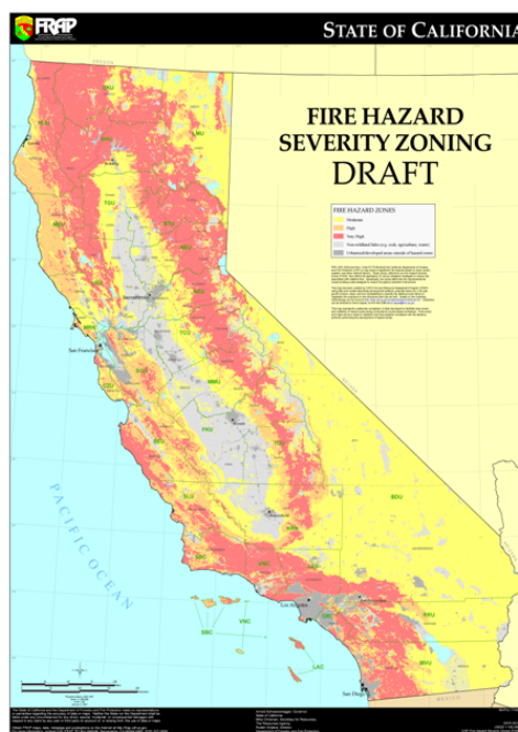
California Fire Hazard Severity Zone Map.