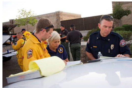
Interagency coordination and planning.