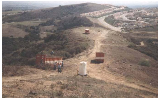
Cooperative fuelbreak, resulting from community planning efforts.