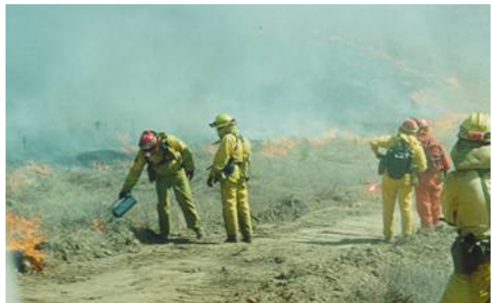
Backfire suppression tactics on a wildland fire.