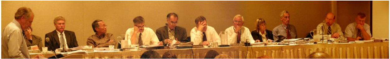
State Board of Forestry and Fire Protection.

The Board is a Governor-appointed body, whose members are appointed based on their professional and educational qualifications and their general knowledge or interest in watershed management, forest management, fish and wildlife, range improvement, forest economics or land use policy. Of the Board's nine members, five are representatives from the general public, three are from the forest products industry and one member is from the range-livestock industry.