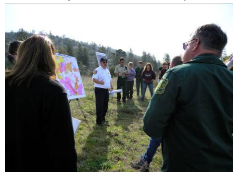
Collaborators viewing Fuelbreak in Fresno County.