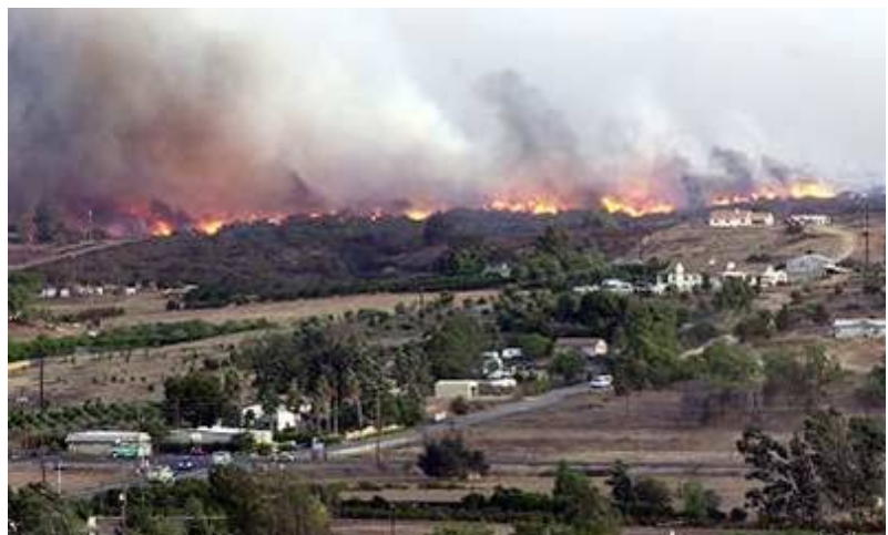
Extreme fire conditions encroaching on urban area.

The complexities associated with ecosystem dynamics in California make statewide or even regional generalizations