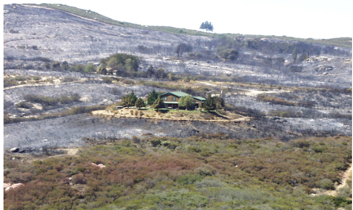
Home surrounded by wildland that survived a fire due to good defensible space.