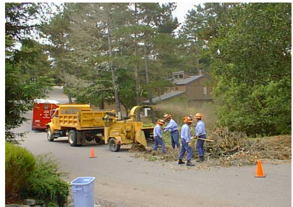
CAL FIRE inmate crew working on a fuel reduction chipping project.