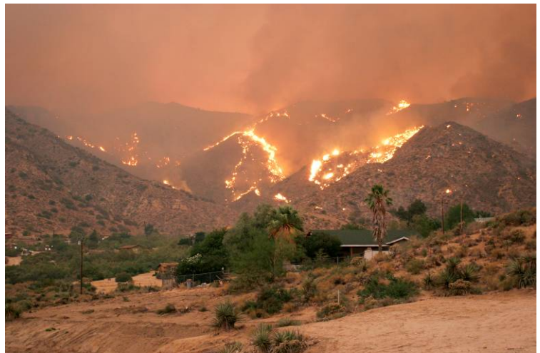
Chaparral wildfire burning near residences.

Under extreme weather conditions, such as high wind or hot dry weather, or when resource availability is limited due to significant fire activity, a small percentage of wildland fires will become large and damaging. As a result, efforts must be taken to create homes and communities that can withstand such fires; develop policies and procedures to promote public and firefighter safety; and educate the public that wildland fire is a natural part of California's landscape.